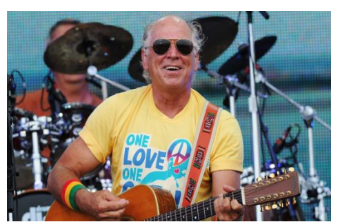
Jimmy Buffett http://blog.indiantrailslibrary.org/?p=113