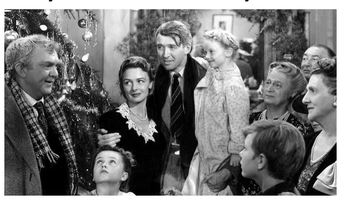
http://drafthouse.com/movies/its a wonderful life/austin

The classic holiday movie It's A Wonderful Life made its screen debut on December 20, 1946.